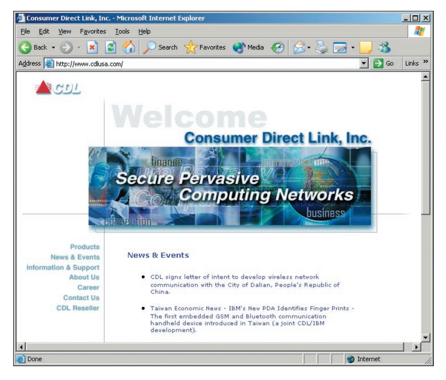
CDL's Secure Pervasive Computing Networks (sPCN) cover the complete scope of a product line, from consumer touchpoint devices to backend data centers.

IBM@server pSeries™; IBM @server xSeries™