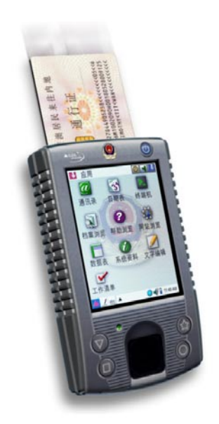
Paron MPC, based on DB2 Everyplace, brings the rich functionality of desktop computing to mobile users.

The largest air cargo terminal in the world at 600,000 square feet, the Hong Kong facility is meeting its security needs without compromising productivity with a sophisticated pervasive computing solution from Irvine, California-based Consumer Direct Link (CDL). Founded in 2000, CDL is a pioneer of pervasive computing networks and developed the cargo terminal's solution with its Paron Multipurpose PC (MPC) personal digital assistant (PDA).