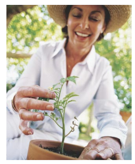
Allianz provides a full range of pension funds and health insurance plans with the help of IBM information management tools.

Apart from a smooth project cycle, the new solution now in place has since demonstrated that the migration was worth it for Allianz. IBM has offered to configure the tools, if necessary, to support additional functionalities of new DB2 versions. As the tools are also specially geared towards autonomic computing, they will also be able to help control future business processes. With this on demand strategy from IBM, Allianz's investment in their IT system is protected in the long term. Furthermore, variable operating costs can be arranged and better adapted to Allianz's actual needs. This has already resulted in a significantly lower total cost of ownership (TCO) after just a few months.