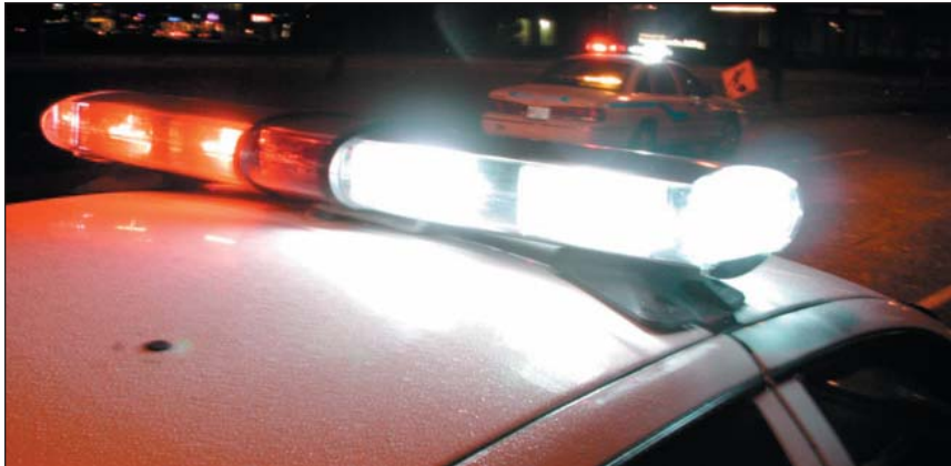
IBM Threat Intelligence solutions allows law enforcement agencies to truly recognize and understand suspects, known terrorists and criminals, witnesses, employees, and more. This allows agencies to implement an integrated end-to-end solution across all aspects of the organization.