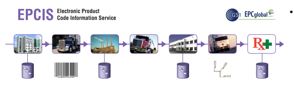
Figure 2. Secure product movement: capture, share data, query & assembly pedigree.

Enterprise systems can easily access the repository through reporting views and open services like Web services or XML. High-volume and granular sensor data is captured for entry. In addition, data duplication is controlled to the extent that enterprise or external systems can consume quality information without the need to store data in each system.