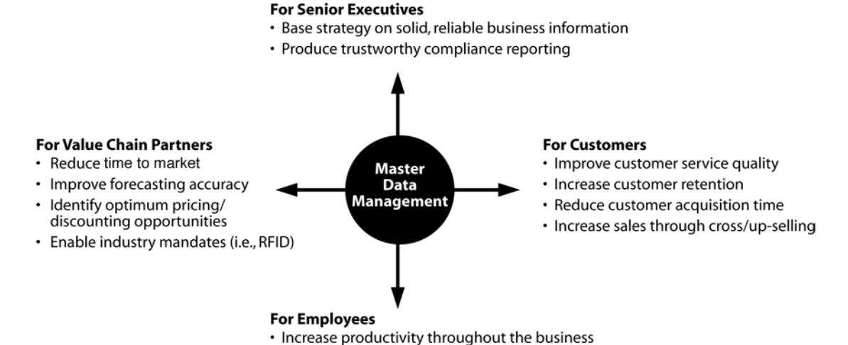
Figure 3: Master Data Management delivers compelling benefits to every face of the business.

Master data management delivers value to all faces of the business. For value chain members, accurate and accessible data can reduce time to market, improve forecasting accuracy, identify optimum pricing and discount opportunities while leaving a company well positioned for possible industry mandates, such as radio frequency identification (RFID). Employees will benefit from productivity gains—they no longer need to manually hunt down and correct the voluminous data errors of the past. Customers will appreciate improved levels of service quality, which drive faster customer acquisition, increased sales through cross-selling and up-selling opportunities and long-term customer retention. Finally, executives will be able to base strategic decision making on solid, reliable information and satisfy compliance reporting with confidence.