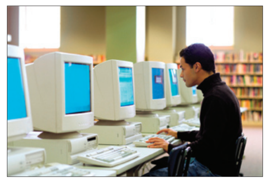
Using services like WorldCat, the world's largest bibliographic database with more than 52 million records, OCLC members receive cost-effective access to a wealth of global library materials.

Business Objects; Cardinal Solutions Group