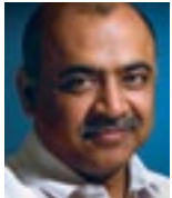
Arvind Krishna General Manager, Information Management Software IBM Corporation

Every day, across your organization, thousands of decisions are made that affect performance in subtle and obvious ways. These presentations set the stage for your Information Management Forum experience by giving you an understanding of what happens when every one of those decisions is driven by real insight and can easily be turned into actions that drive improved performance.