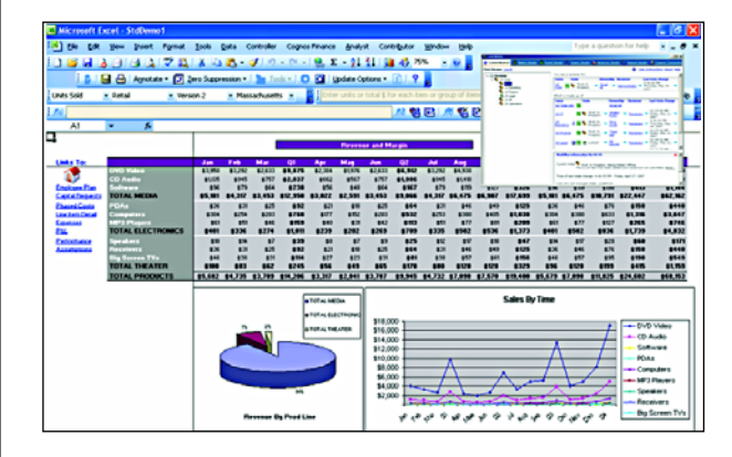
The Microsoft Excel<sup>®</sup> interface offers both power and extendibility to users with complex needs

—all the sorts of things that only a dedicated enterprise planning solution can offer. A dedicated enterprise planning solution provides the power to model, forecast, analyze, and report on a company's key operational processes, manage asynchronous business cycles, and reliably translate plans and forecasts into a single, cohesive, accurate view of financial performance. An enterprise planning solution