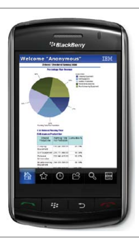
Securely access dashboard content on your iPhone, iPad, BlackBerry and more with IBM Cognos Mobile.