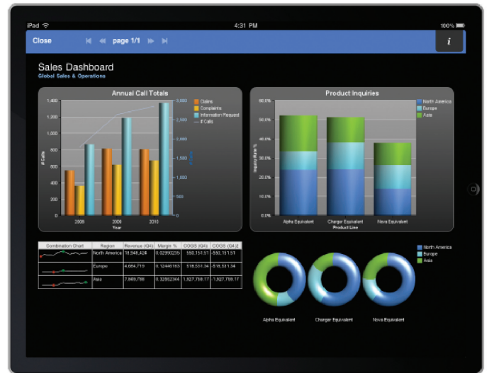
Users can customize their user experience on various handheld devices.

Users can fully interact with BI data on their iPhone or iPad with the touchscreen. They can also personalize their BI experience with the ability to customize the user interface.