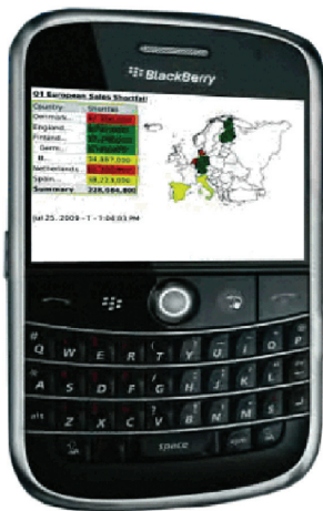
Users can fully interact with BI content on their handheld devices.

An optimized search engine helps users quickly find what they're looking for.