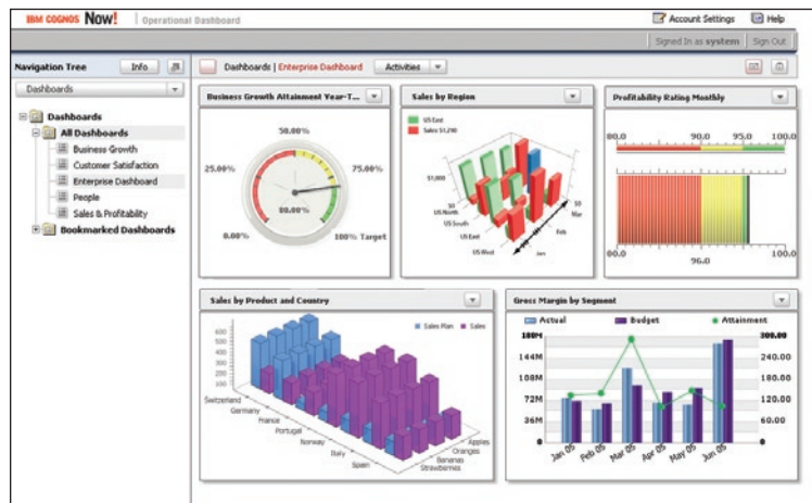
IBM Cognos Now! includes easy-to-use Operational Dashboards that continuously display up-to-date information in an intuitive, graphical format.)