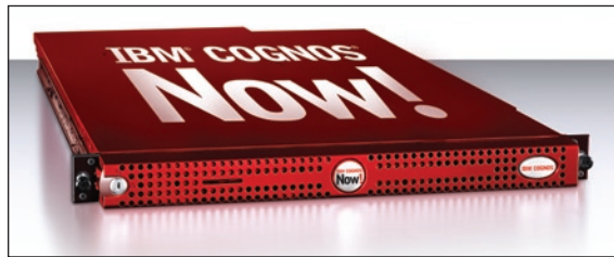
IBM Cognos Now! is an operational BI solution that delivers highly visual and self-service interactive dashboards, data integration, analysis, and reports, all prepackaged in a hardware appliance.)

As a single product that contains Operational Dashboards, reports, analysis, alerting, ETL, and data integration, IBM Cognos Now! eliminates the key barriers to delivering operational BI at a cost that can finally make it a reality.