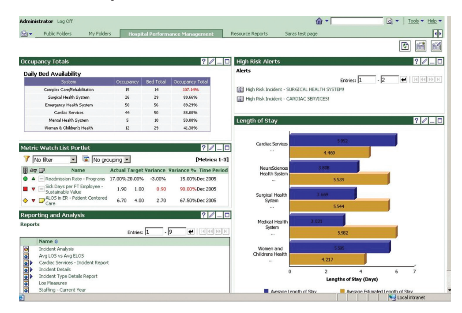
Figure 3: Dashboards provide critical information at-a-glance. From there, you can drill into additional detail or analysis.