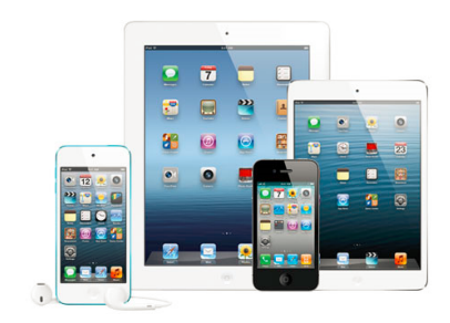
Figure 1: Sample mobile devices.