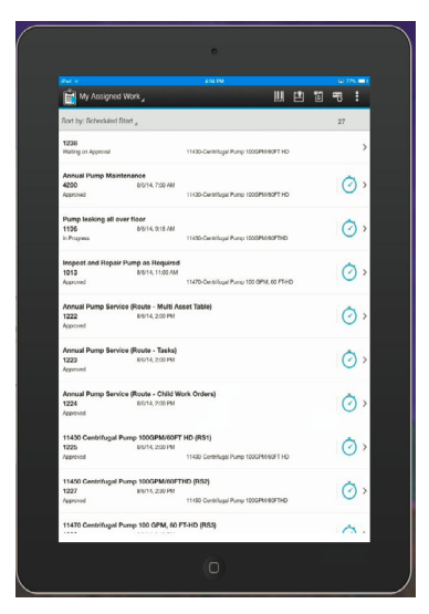
Figure 2: Screenshots showing an inspection work order and work assignments.