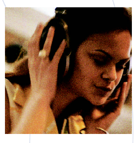
Consumer Uses and enjoys creative works. Can send content to their friends for sampling and purchase.