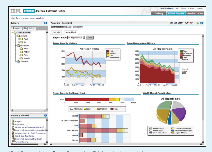
IBM Rational AppScan Enterprise Edition dashboard view