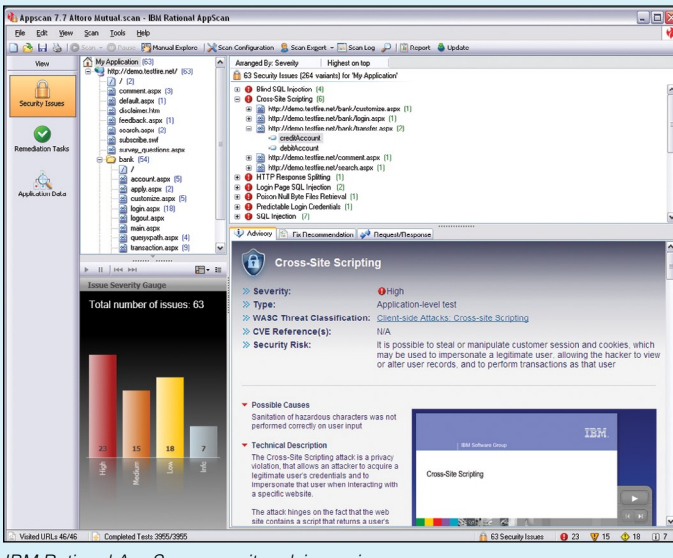
IBM Rational AppScan security advisory view