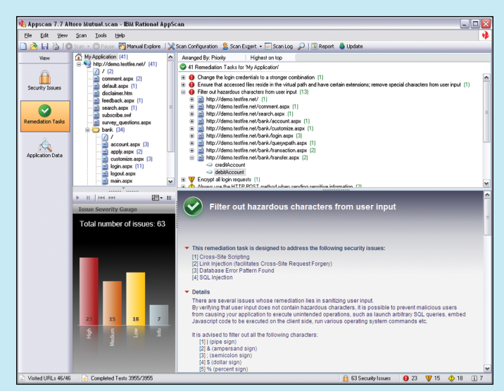
IBM Rational AppScan remediation view