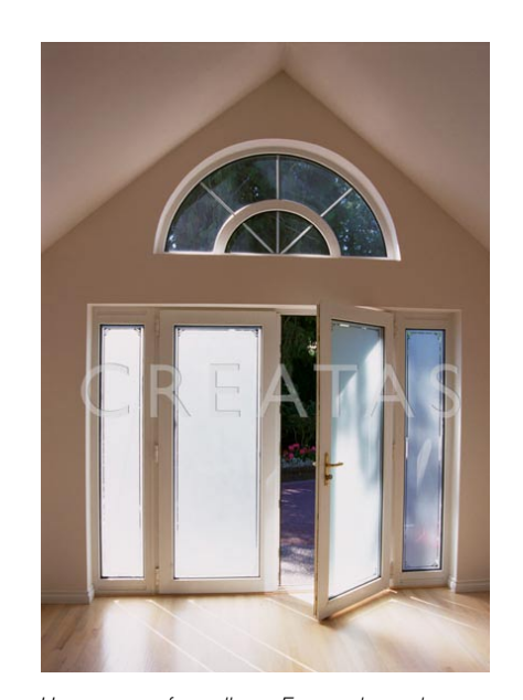
Homeowners from all over Europe depend on TRYBA for high-quality doors and windows.