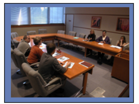
TALK / TEACH