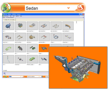
3D Search! Download and install...with the 3DLive toolbar in your browser you can find data and projects, query indexed databases, and check for dependencies and impacts in minutes instead of hours.

The ultimate goal of 3DLive is to optimize your company's unique knowledge environment so that people get the contextual information they need to be productive and innovative—no matter what their job, language, or location. Here's how.