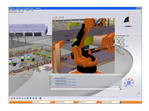
3D Heads-up enables dynamic chat, 3D image-sharing, co-navigation, and annotation!

adds robust collaborative review capabilities to the powerful search, visualize and navigate paradigm delivered in 3DLive. Providing out-of-the box support for CATIA—3DLive, the Live Collaborative Review solution increases your business agility by supporting design reviews anytime, anywhere people need specific product information to make decisions and drive downstream activities.