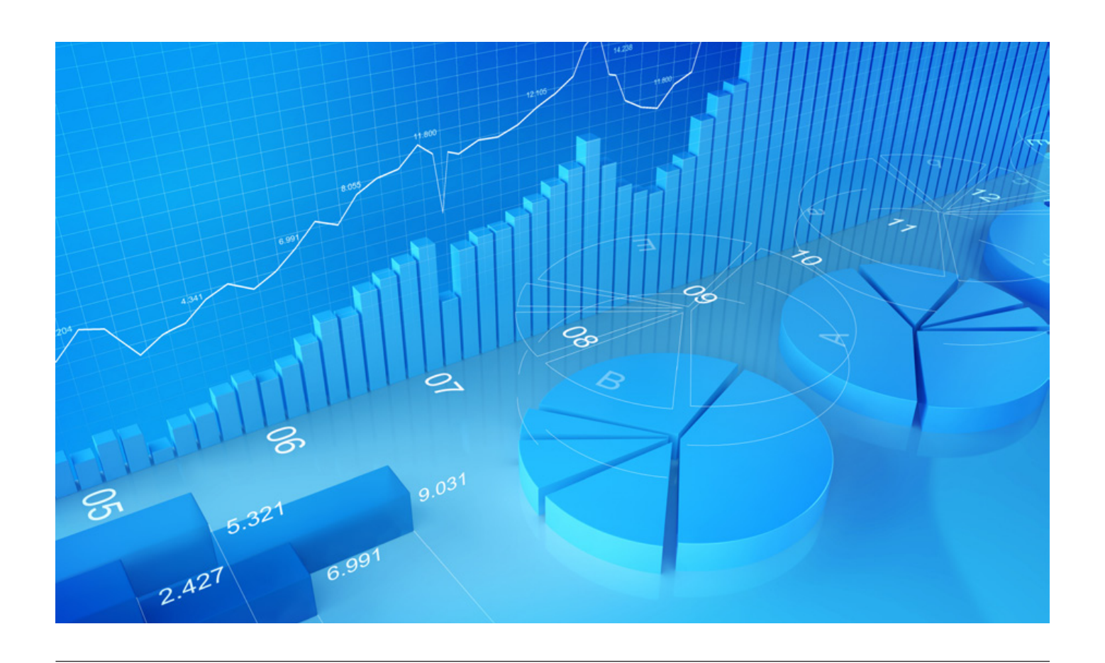
With DB2, organizations gain the insight and agility they need to capitalize on new opportunities, contain costs and satisfy customers.