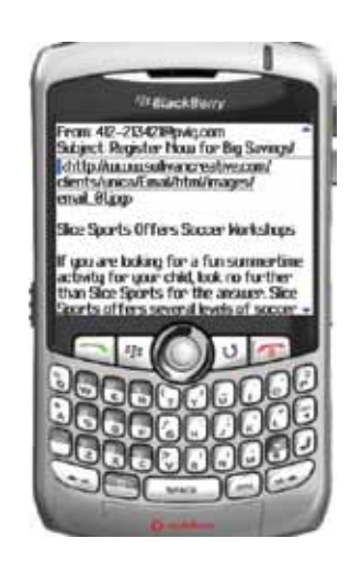
BlackBerry: Shows text part of HTML as well as URLs for links and images