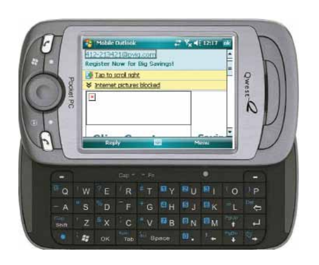
Windows Mobile 6: HTML supported, but images-off under default settings