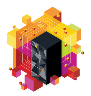
IBM zEnterprise Technology Summit — A Virtual Event on June 27, 2013

Click here for additional information and registration.