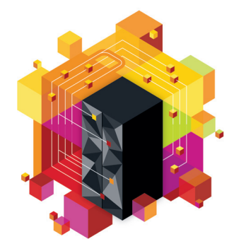
IBM zEnterprise Technology Summit — A Virtual Event on June 27, 2013

Click here for additional information and registration.