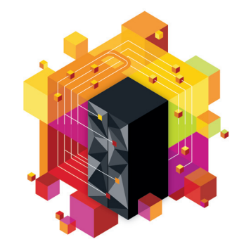
IBM zEnterprise Technology Summit — A Virtual Event on June 27, 2013

Product experts will be on-site and available to answer your questions until 5:00 p.m. EDT in the U.S. and 5:00 p.m. BST / 6:00 p.m. CET in Europe. If you need advice on a technical issue – whether or not it is a session topic – this event is a great opportunity to talk to an expert individually, in group chat sessions or in forum discussions with other technical professionals.