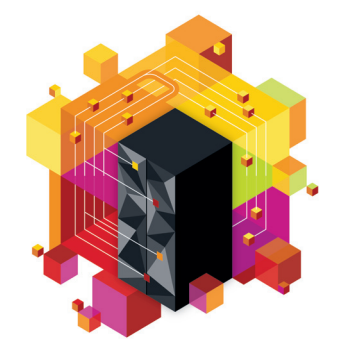
IBM zEnterprise Technology Summit — A Virtual Event on June 27, 2013

Click here for additional information and registration.