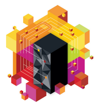
IBM zEnterprise Technology Summit — A Virtual Event on June 27, 2013

Click here for additional information and registration.