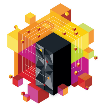
IBM zEnterprise Technology Summit — A Virtual Event on June 27, 2013

Click here for additional information and registration.