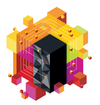
IBM zEnterprise Technology Summit — A Virtual Event on June 27, 2013

Click here for additional information and registration.