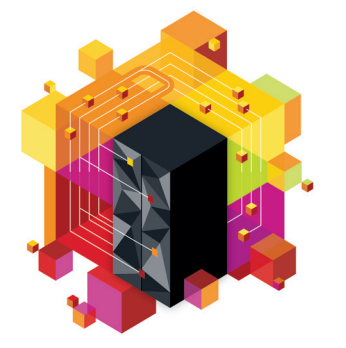
IBM zEnterprise Technology Summit — A Virtual Event on June 27, 2013

Click here for additional information and registration.