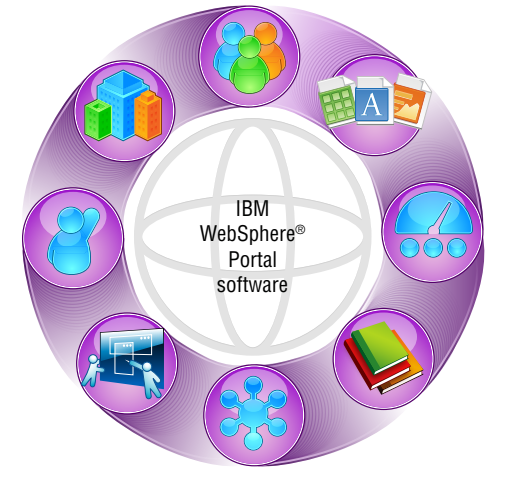
Figure 1. IBM WebSphere Portal software provides best-inclass portal, content management, collaboration, business integration and security technology to help you improve employee productivity and increase citizen satisfaction.

As an example, the U.S. Securities and Exchange Commission (SEC) processes thousands of filings each year, many of which include highly sensitive information. When the SEC updated its electronic filing system, it used Lotus Forms software to create XML templates for all 397 SEC forms. These electronic forms can be completed, validated, digitally signed and securely submitted to the SEC. In addition to providing increased security, Lotus Forms software enables the SEC to save taxpayers approximately US$150,000 per month in maintenance costs.