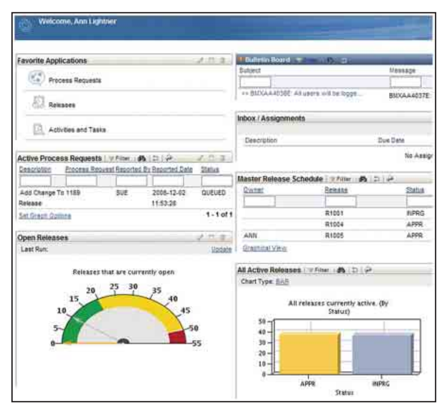
Tivoli Release Process Manager's home page supports daily tasks and activities.

Because it is integrated with Tivoli CCMDB, Tivoli Release Process Manager delivers consistent release tracking, from planning to production, using a single tool. It integrates seamlessly with your existing operational management products, such as IBM Tivoli Configuration Manager for automating patch and application deployments and IBM Tivoli Provisioning Manager for automating complex deployments across multiple servers. Tivoli Release Process Manager also delivers out-of-the-box reports on key performance indicators (KPIs), to help align releases with your business objectives.