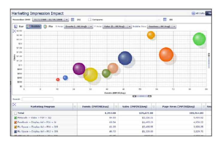
Figure 3: Impression Attribution to track effectiveness of your marketing campaigns

You may want to create a targeted email campaign based on the web analytics behavioral data that you are collecting for your website. Coremetrics LIVEmail enables email marketers to deliver the right content at the best time. By seamlessly combining data collected by Simplified Tagging and LIVE Profile<sup>™</sup>, LIVEMail can export behavioral data to leading Email Service Providers (ESPs) partnered with Coremetrics. LIVEmail's ESP interface enables you to view