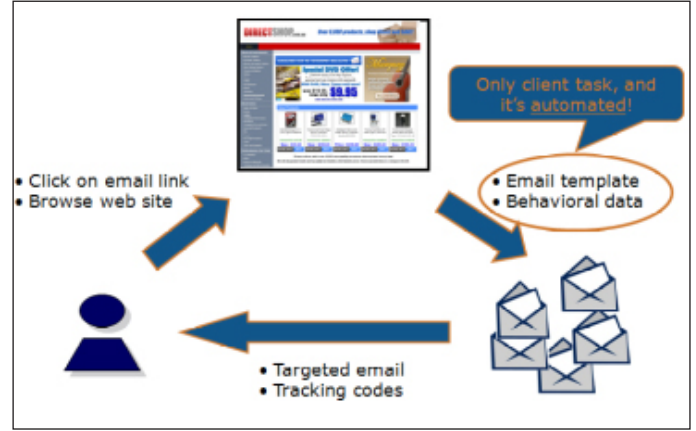
Figure 4: LIVEMail makes it easy to create campaigns

certified partners or easily request new partner certification. You can then simply click a button and LIVEmail will export the data to your ESP in a pre-defined, digestible format. This straightforward interface enables you to quickly connect your data to the appropriate ESP and optimize your email marketing initiatives.