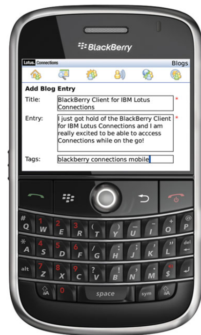
Figure 1: The BlackBerry smartphone runs Lotus Connections software.

The BlackBerry clients for IBM Lotus software leverage the security features of the BlackBerry Enterprise Server, providing security-rich transmission of data. And, for administrators, the combined IBM and RIM solution helps reduce the challenges of managing remote employees' devices by: