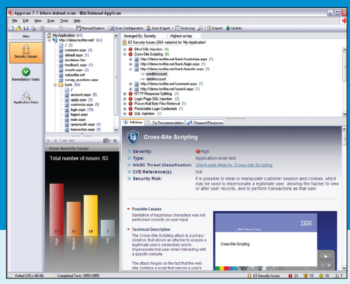
The IBM Rational AppScan security advisory view