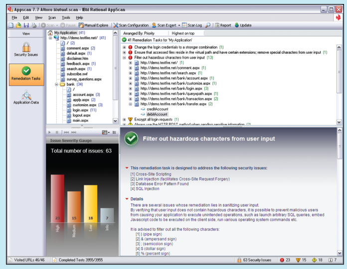
The IBM Rational AppScan remediation view