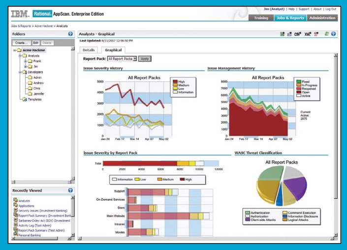
The IBM Rational AppScan Enterprise Edition dashboard view