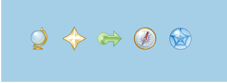
Figure 3. The Welcome page choices (Windows)