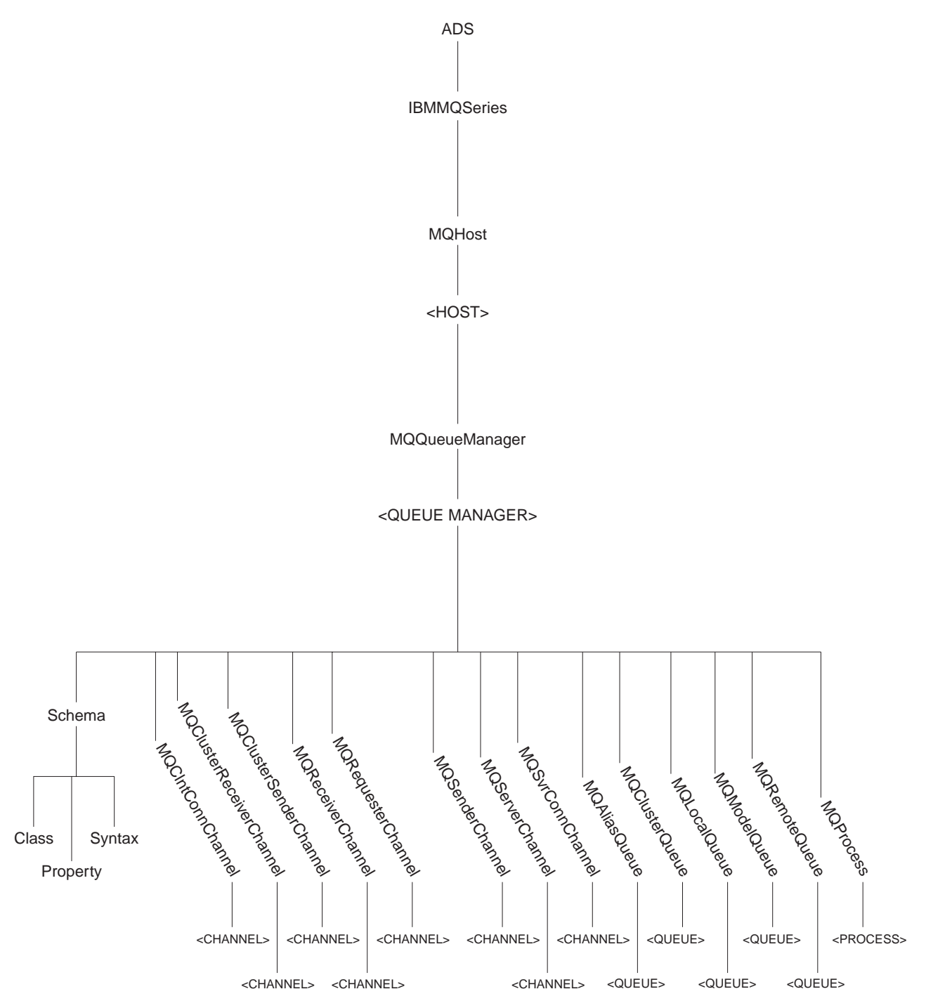
Figure 3. MQSeries object hierarchy