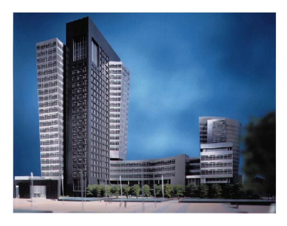
Model of the new ABN AMRO Bank headquarters scheduled to open in 1999.