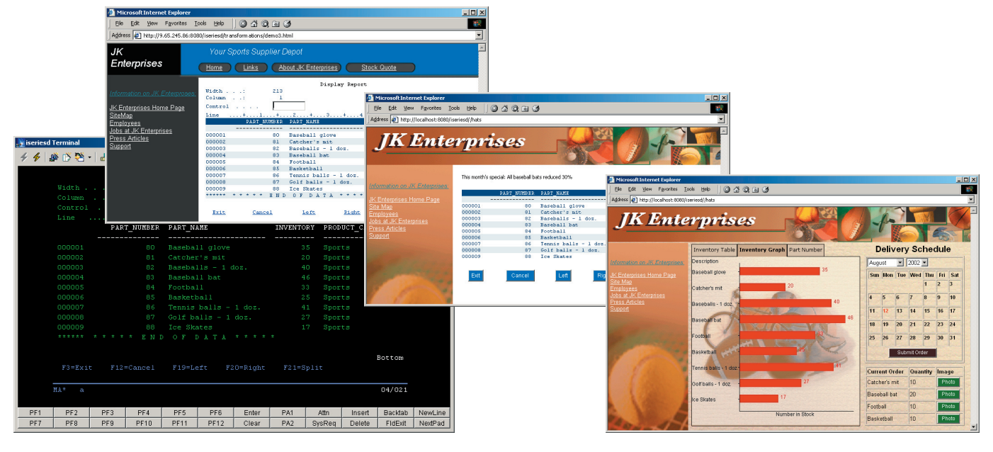
Figure 1. With IBM WebSphere Host Access Transformation Server, you can get on the Web quickly and add customization at your own pace.

IBM WebSphere® Host Access Transformation Server (HATS) gives you the tools you need to quickly and easily extend your legacy applications to business partners, customers and employees. HATS makes your 3270 and 5250 applications available through the most popular Web browsers, while at the same time converting your host screens to a Web-like look and feel. HATS provides a zero-footprint Web-to-host solution—the only software needed on the client is a Web browser.