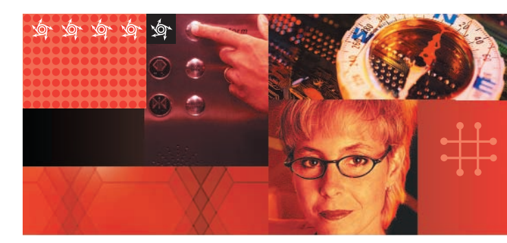
IBM Tivoli Sales Pocket Guide