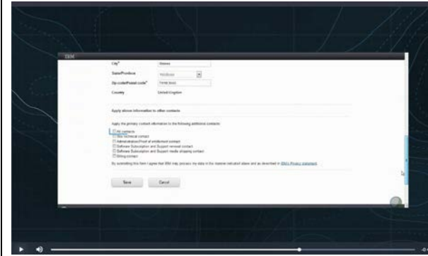
Show them using the "apply information to other contacts" feature and clicking submit

Continue to review and update any contacts on your site under the "Your IBM contacts" list. Select a user and click "edit."