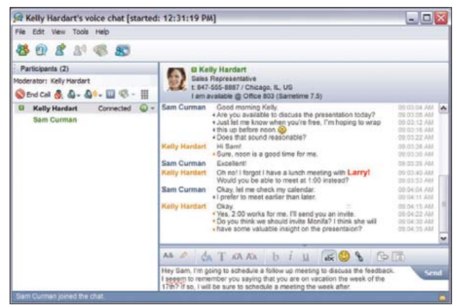
With VoIP technology embedded within IBM Lotus Sametime 7.5 software, you can save money by engaging in real-time voice communications using your existing network bandwidth.