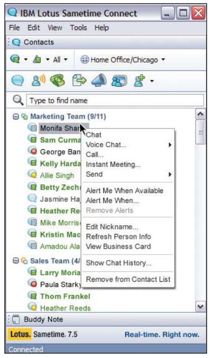
IBM Lotus Sametime 7.5 software provides collaboration capabilities such as voice chat and access to public and enterprise IM networks—all from a single interface.

A comprehensive instant messaging (IM) and Web conferencing solution, Lotus Sametime 7.5 software provides the communication and collaboration tools you need to run your business in real time. Built-in security features allow you to reliably exchange confidential business information—and you can be confident that only your intended recipient will have access to it and that your recipient's identity has been verified. And Lotus Sametime software is designed to integrate with your existing IT environment, providing significant cost savings and a consistent technology approach across your entire enterprise.