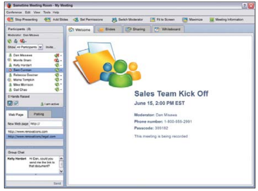
People around the world can view the same information in real time and at the same level of quality using IBM Lotus Sametime 7.5 Web conferencing capabilities.

Lotus Sametime software's Web conferencing functionality is so easy to use, even first-time users can create, participate in or moderate a Web conference without training or technical skills. Team members located around the globe can stay on the same page by viewing the same document or presentation at the same time and same level of quality. And you can