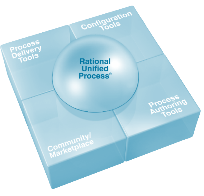
The RUP platform provides the methodology and tools you need to provide your team with customized, practical process guidance.

In RUP, a Plug-In is a process component containing textual and graphical guidelines, examples and templates relevant for a specific technology, tool, or domain. This architecture enables you to easily configure the process for your project's specific needs. Plug-Ins also provide a mechanism for industry-leading companies to supplement RUP with content specific to their technologies — such as Microsoft's