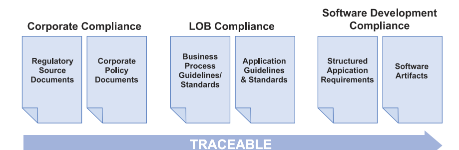
Figure 2. Policy management involves stakeholders across the enterprise. IBM Rational RequisitePro can help your organization trace the impact of policy decisions across Corporate, Line-of-Business, and IT organizations.