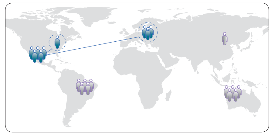
Rational ClearQuest enables development teams to access resources that are not locally available.

IBM Rational ClearQuest software helps enable you to manage geographically distributed testing projects, so that you can leverage