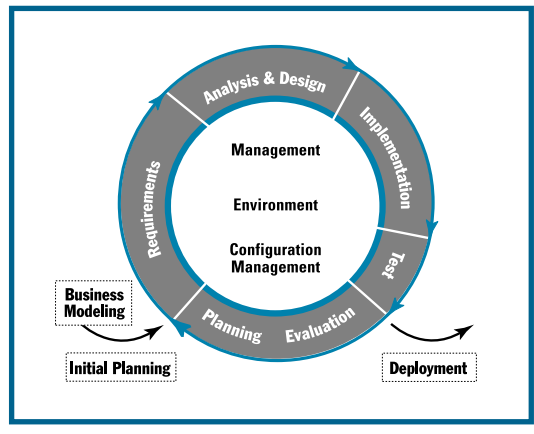
Each project iteration cycle begins with a plan for what will be accomplished and concludes with an evaluation of whether objectives have been met.

Overriding all requirements was the need for end-to-end accuracy. Submitting incorrect or incomplete data could delay eligible applicants from receiving access to needed health benefits and require costly manual intervention on the part of the state or county health departments.