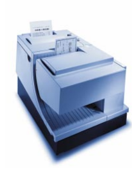
The IBM 4610 SureMark ^{\mathsf{m}} Point-of-Sale Printer The SUREPOS ^{\mathsf{m}} Family