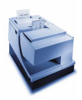
The IBM 4610 SureMark<sup>™</sup> Point-of-Sale Printer The SUREPOS<sup>™</sup> Family