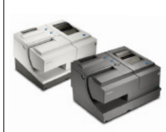
FV5, GR3, GB3, GB5, GR5 GE3