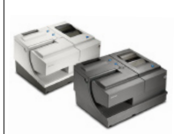
FV5, GR3, GR5