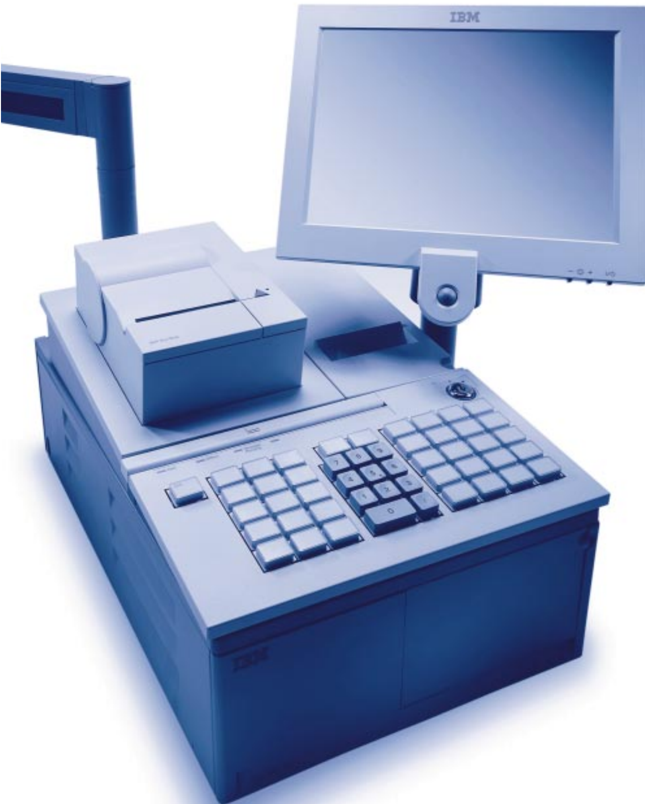
IBM SureMark Printer Model TM6 / TM7 integrated with IBM SurePOS 750