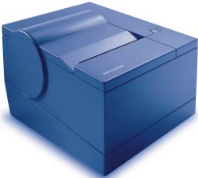
IBM SureMark Printer Model TF6 / TF7