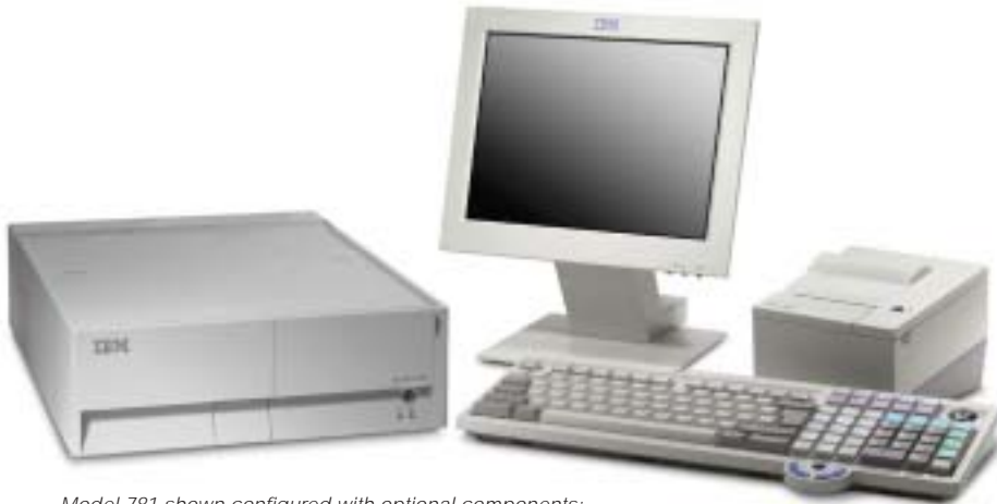
Model 781 shown configured with optional components: IBM SureMark printer (TM6), IBM SurePoint Solution and ANPOS Web-enabled keyboard with pointing device.