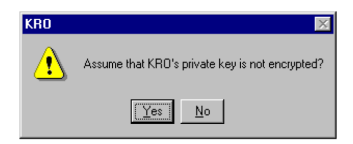
Figure 3. KRO Private Key Not Encrypted

4. The Key Recovery Officer Request Monitor screen then appears (Figure 4).