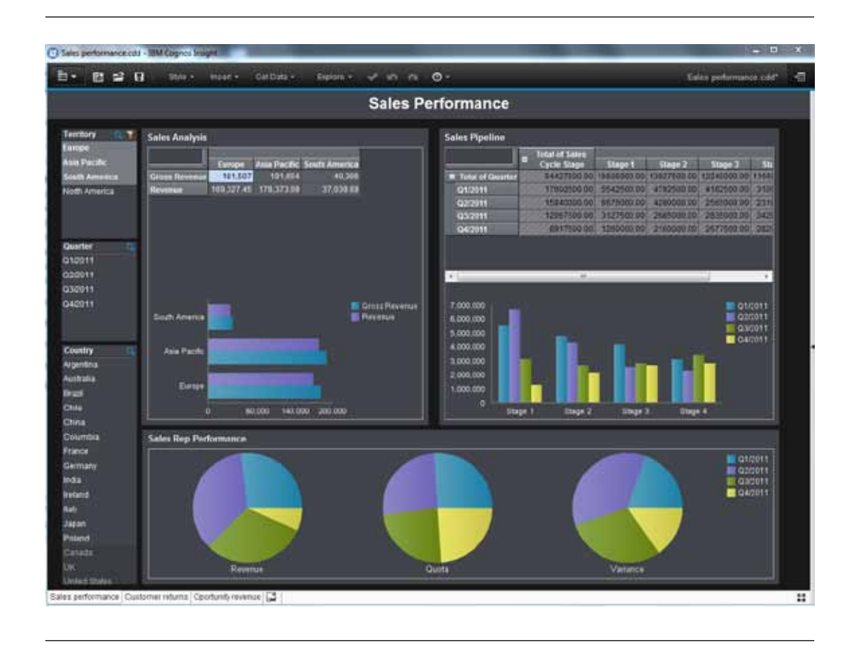
Figure 3 : "What-if" scenario modeling lets you analyze and optimize your plans based on different assumptions that take into account ever-changing market conditions.

To easily navigate through large data sets with multiple dimensions, you can filter results based on the association between related groups of information. You can even apply a simple search to these explore points to further drill down to a particular member in a set and other information related to that member. When combined with visualizations, this powerful point-and-click approach allows you to quickly spot trends and identify outliers.