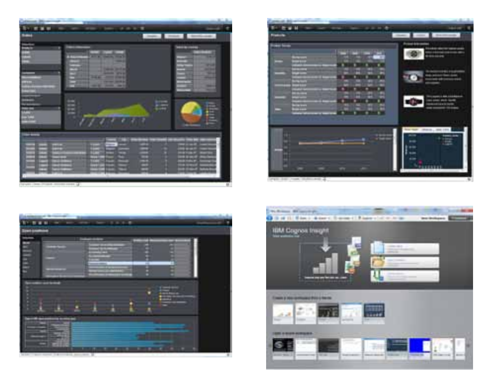
Figure 1: An intuitive, easy-to-use interface provides complete user flexibility to independently create compelling dashboards and analytic applications.