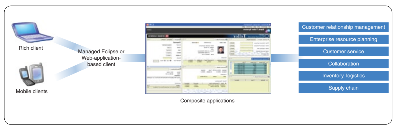
Figure 5. A high-level view of IBM Lotus Expeditor software

Custom offline applications provide the greatest amount of developer control in terms of the user experience and data exchange between the client and the server. This includes control over what data is stored locally on the client and synchronized with the remote server. IBM Lotus Expeditor software provides an SOA-based, server-managed client platform that enables developers to extend existing applications to a variety of mobile devices such as laptop computers, tablets, smartphones and Windows Mobile personal digital assistants (PDAs). By using the Eclipse Rich Client Platform<sup>4</sup> as a core technology and by integrating security, device management and middleware, Lotus Expeditor software allows applications to be taken offline and used when a connection to the network is unavailable, unreliable or expensive.