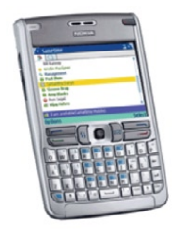
Figure 2. The Lotus Sametime mobile client running on a Nokia E series device

Plus, you can extend Lotus Sametime IM support to mobile devices without having to purchase a companion application (such as IBM Lotus Sametime Everyplace® software). Currently, Lotus Sametime mobile client supports Nokia, BlackBerry and Windows Mobile devices, and the list will continue to expand with future releases.