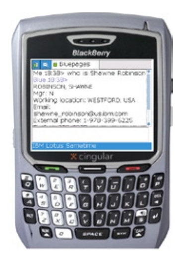
Figure 4. An example of BOT access to a corporate directory from a Lotus Sametime mobile client running on a RIM BlackBerry device

BOT technologies provide an automated IM interface to applications. These technologies can deliver high-value solutions to users through a familiar paradigm, by taking advantage of the fast learning curve for IM capabilities. For mobile workers in particular, BOT applications provide the added benefit of displaying and exchanging data through an existing transport layer and presentation layer. For example, sales representatives can query a customer relationship management system in the same way they would initiate an online chat. And the response is then provided in a familiar chat format.