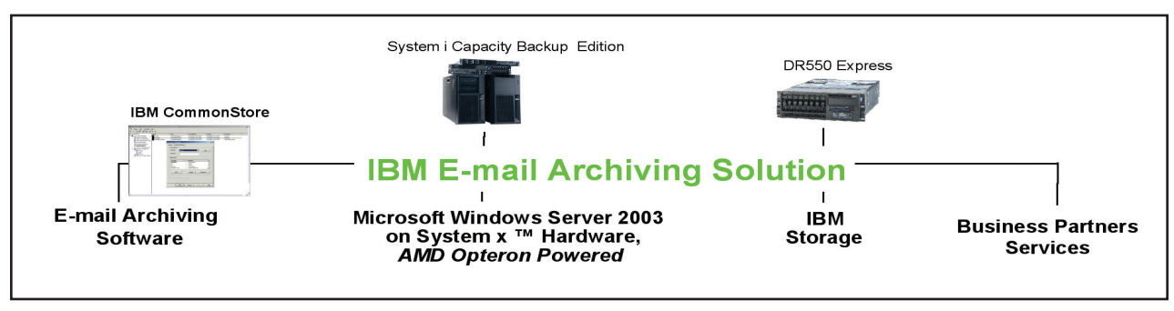
Technical Architecture for Implementing the Email Archive Preload Solution

IBM CommonStore eMail Archiving Preload is a software and hardware solution that helps address your immediate and future challenges with growing e-mail systems. This solution archives e-mail and attachments into IBM Content Manager, where they are retained according to your company's governance, compliance and legal support policies but remain accessible to users. To make things easier for midsized companies, it comes with the IBM CommonStore and Content Manager software already loaded and tested on a high performance, low power IBM System x platform powered by nextgeneration AMD processors. It is also offered as a Solution Starting Point from the Solutions Builder Express Portfolio, and your Business Partner can use it to speed implementation of your e-mail archiving and compliance solution.