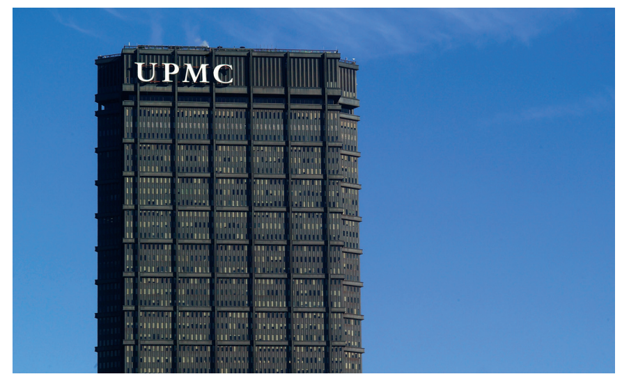
Widely recognized for its innovations in patient care, research, technology and healthcare management, UPMC is an integrated global health enterprise and one of the leading nonprofit health systems in the United states. Based in western Pennsylvania, UPMC is the region's largest employer, with 50,000 employees and nearly US$8 billion in revenue.

When UPMC joined with IBM in an eight-year, US$402 million partnership designed to transform its IT infrastructure, the deal was viewed as a watershed in how IT vendors and their customers work together. Today, with the deal at the halfway mark, the UPMC and IBM collaboration has met the original expectations and, in many instances, has exceeded them. What continues to make the partnership unique is how the companies' shared vision of the future of healthcare delivery is cemented by a shared commitment to fostering healthcare innovation.