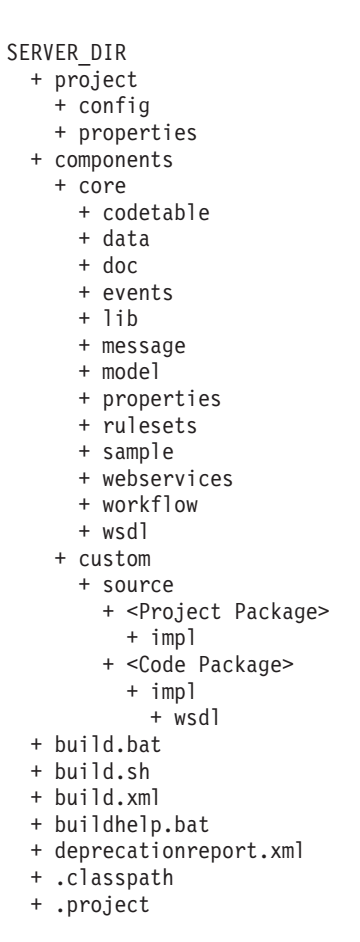
Figure 1. Cúram Application Structure