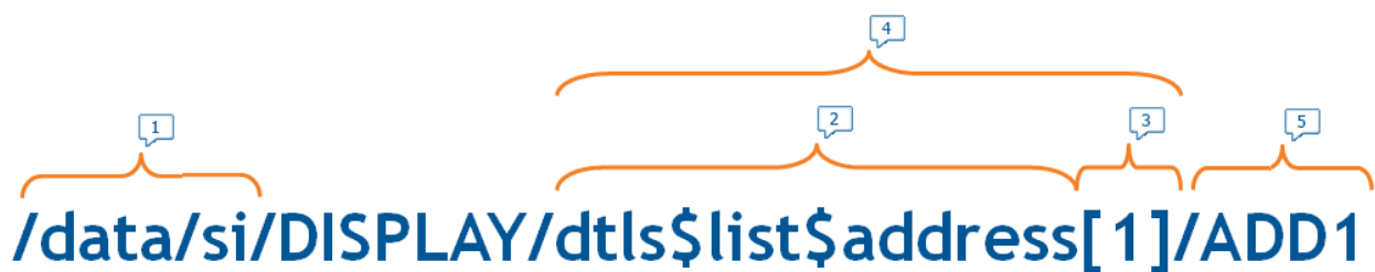
Figure 54. The Anatomy of a Path

Paths are references to sources of data. They are similar in concept to file system paths used to access files or XPath expressions used to access data in a structured document. All access to data of any kind from a renderer is performed via paths. Paths can be used to access the values of server interface properties, text in localized properties files, localized properties resources in the database and other values. The terminology used to describe the parts of a path is shown in the figure below.