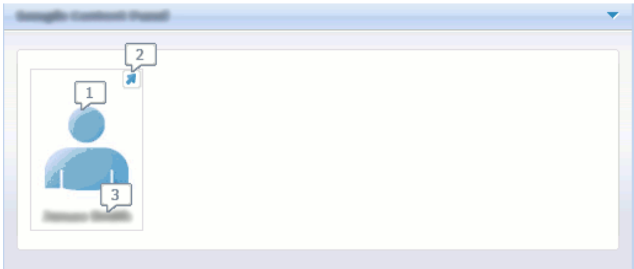
Figure 9. Context Panel Showing a Photograph of a Person