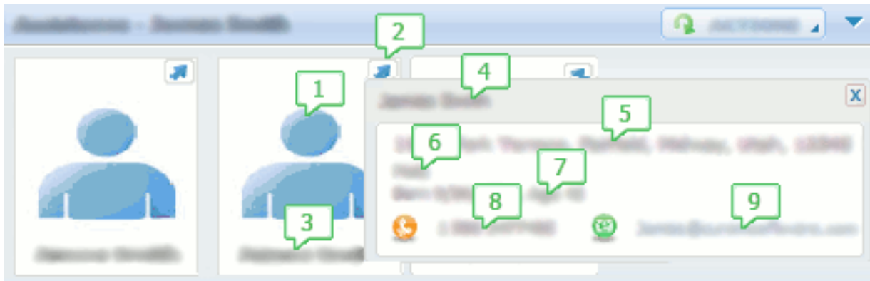
Figure 8. Context Panel for a List of Case Participants