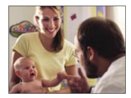
Committed to meet its community's needs, The Caring Foundation, provides free or low-cost health insurance to uninsured children in Philadelphia and surrounding counties.